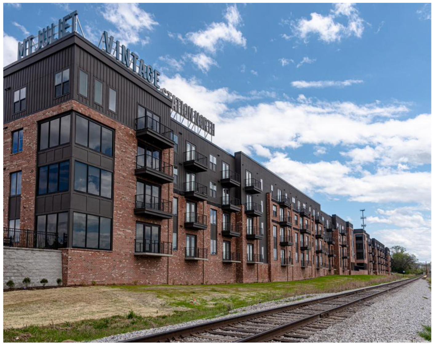
Photo tour: Vintage Station North, a mixed-use development at the WeGo Star stop in Mt. Juliet